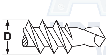
Fine Thread Drill Point Drywall Screw