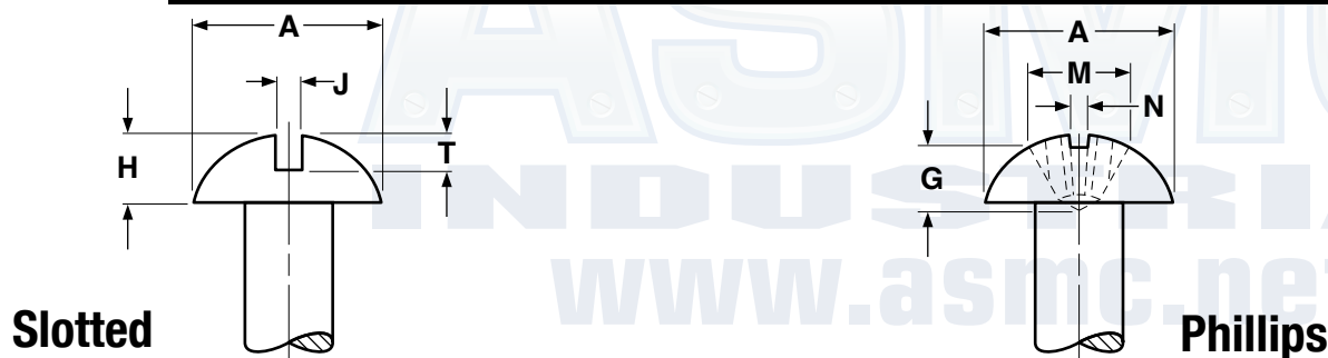
ROUND HEADS FOR MACHINE SCREWS